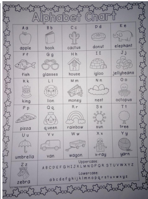
The Alphabet sheet handed at the end